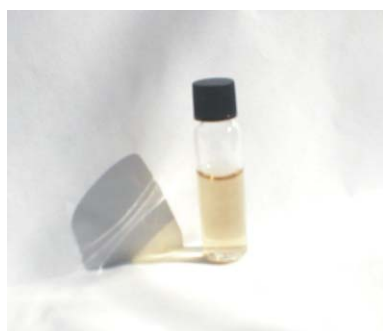
Fig. 1 A stable dispersion of glycopolymer-stabilized nanoparticles in aqueous solution.

molecules adsorbed on the surface of agarose beads. Thus, this assay is similar to the well-known hemagglutination assay for plant lectins. 4